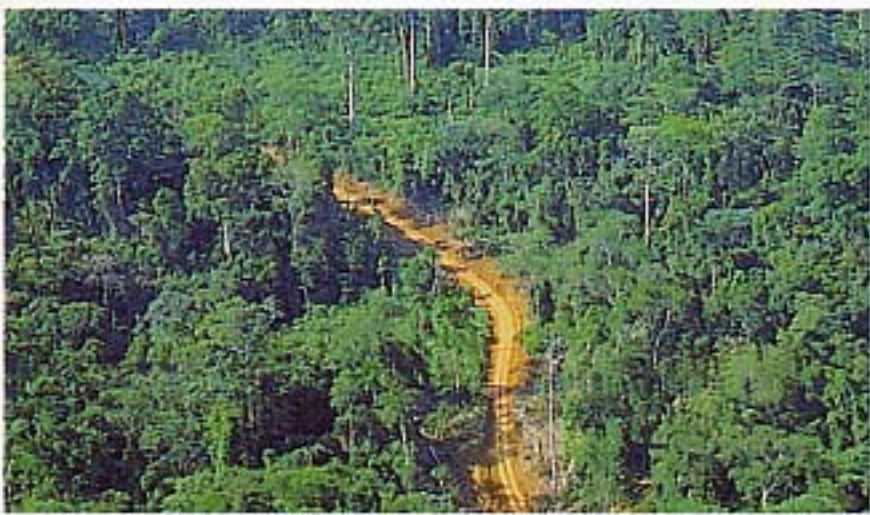
Okoumé, "arbre de lumière" a specie that flourish in sunlight From GABON'S FOREST.